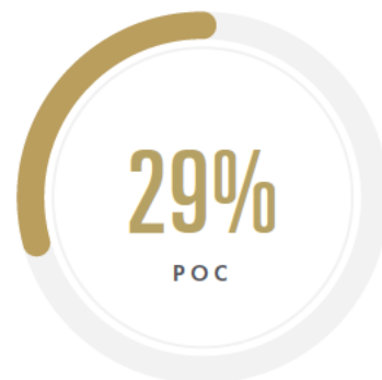
2019 NEW MEMBERS