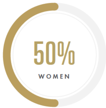
2019 NEW MEMBERS